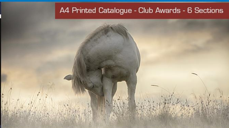
Above Right Golden Beauty by Ralph Duckett

A4 Printed Catalogue - Club Awards - 6 Sections