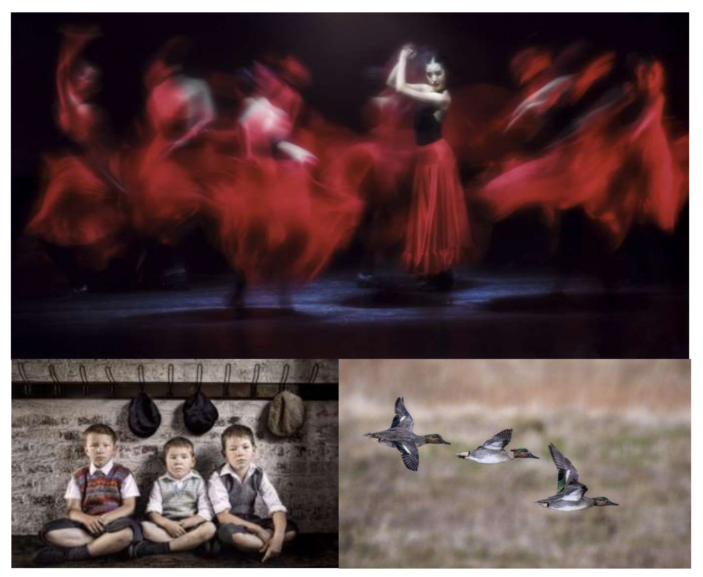
Photographs from each of the winners of the Best Clubs 2017 can be seen above. Top – Fire Dance by Im Kin Wan, PHOTOGRAPHY SALON SOCIETY OF MACAO; Bottom Left – Wasn't Me by Mike Sharples, SMETHWICK PHOTOGRAPHIC SOCIETY; Bottom Right – Teal in Flight by James Moir, EDINBURGH PHOTOGRAPHIC SOCIETY.