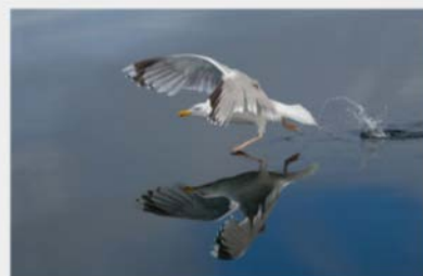
Herring Gull Walking on Water by Lizzie Wallis, England Awarded: PSA Gold Medal - Best Overall