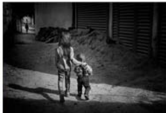
DUM23_Anne Greiner_Little brother.jpg