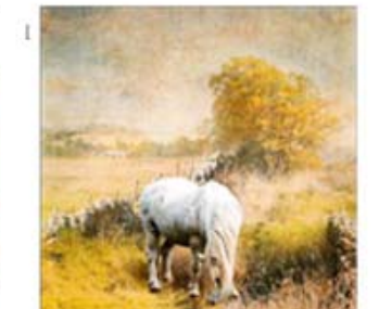
DUM27_Colin Marr_All alone.jpg