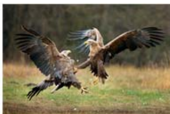
DUM29_Edmund Fellowes_White tailed eagles fighting.jpg