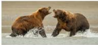
DUM3_Gordon Rae_Brown bear fight - Alaska.jpg

This is a contact sheet of the Dumfries entry to the Final. Some scored well but some did not!