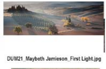
DUM21_Maybeth Jamieson_First Light.jpg