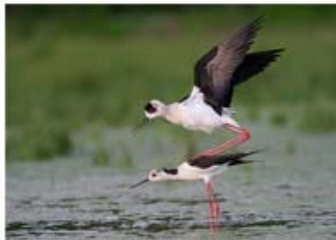
DUM10_Mick Durham_Black tailed godwits.jpg