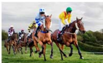
DUM22_Maybeth Jamieson_Up hill.jpg