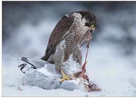
02 WMcC Peregrine in Winter