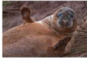
E01_02_Grey Seal Pup