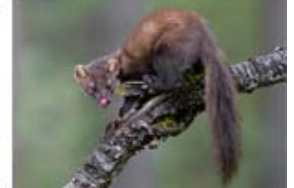
E01_20_Female Pine Marten