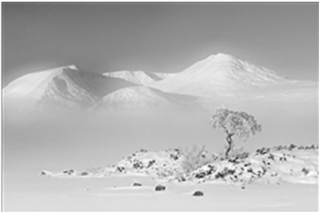
08 Winter Mountains