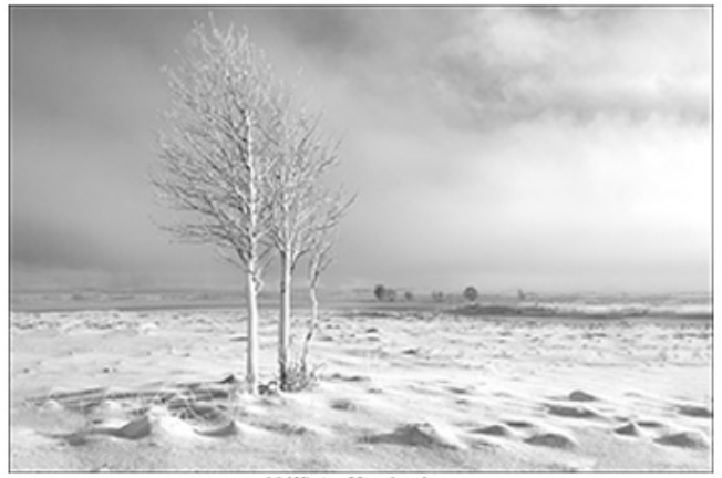
02 Winter Moorland