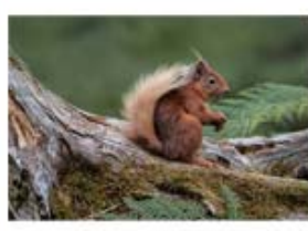
E01_07_Squirrel on Tree Stump