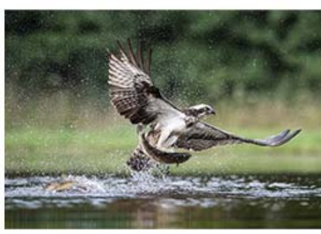
05 Osprey with Fish