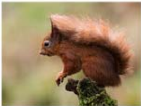
E01_06_Squirrel about to Leap