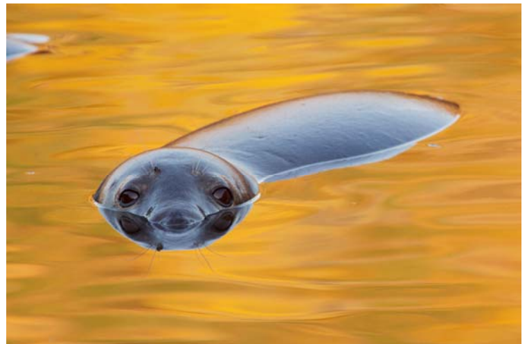
Grey Seal at Dawn by Edmund Fellowes