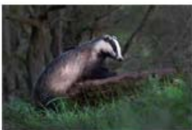
E01_16_Badger in Evening Light