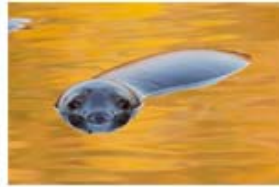
E01_03_Grey Seal at Dawn