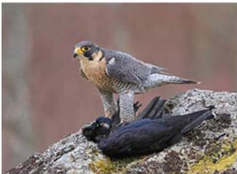
04 AD Peregrine on Prey