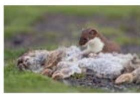
E01_17_Stoat with Prey