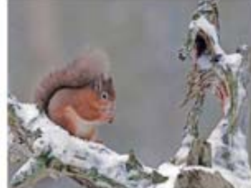
E01_08_Red Squirrel in Snow