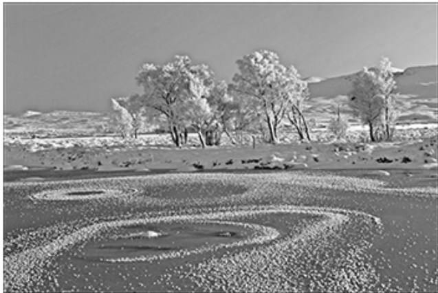
06 Winter Patterns