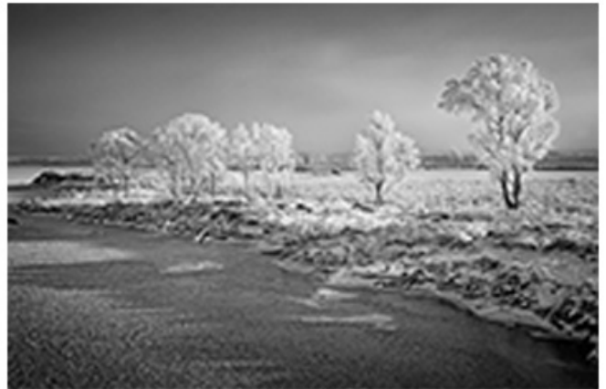
07 Winter Frost