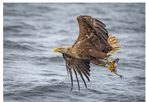
09 JM White Tailed Eagle with Fish