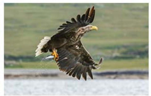
10 | McF Sea Eagle with Catch