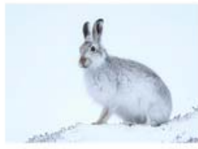
E01_12_Mountain Hare in Snow