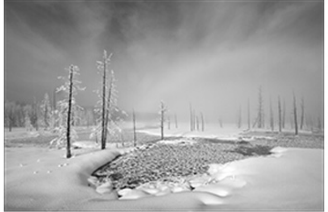
05 Winter Trees