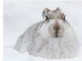
E01_09_Hare in Snow