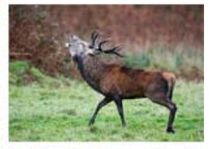
E01_15_Bellowing Red Deer Stag