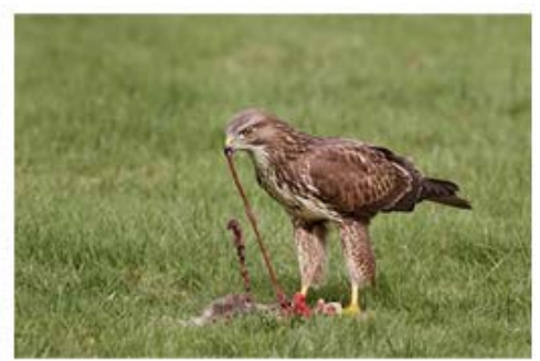
03 common buzzard feeding on rabbit