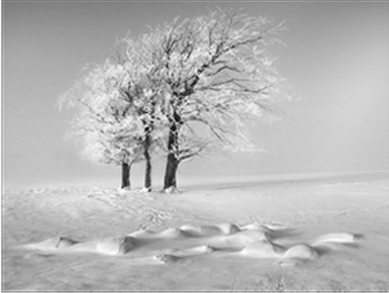
03 Winter Treeline