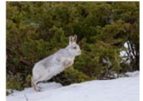
E01_10_Hare Leaping in Snow