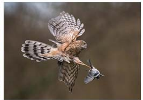
06 MD Predator and Prey