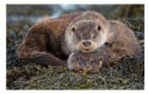
E01_05_Mother Otter and Cub