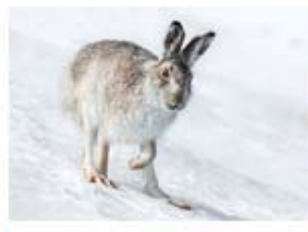
E01_13_Cairngorm Mountain Hare