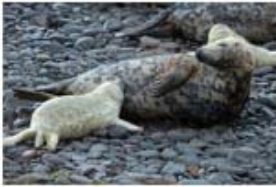
E01_01_Grey Seal Suckling Pup

Both Nature Biennials were judged by the same three judges, with one from Luxembourg, one from Kuwait and the third from Bahrain.