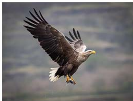
08 AH White Tailed Eagle with Prey