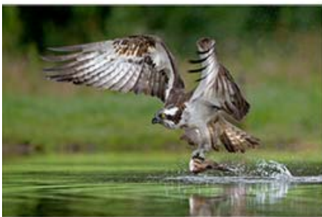
07 MC Osprey with Catch