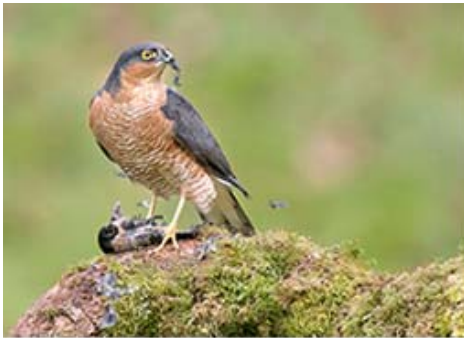
01 KW Sparrowhawk with prey

The number of participating countries was 28