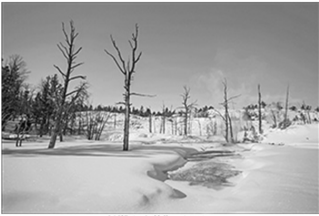
01 Winter in Yellowstone