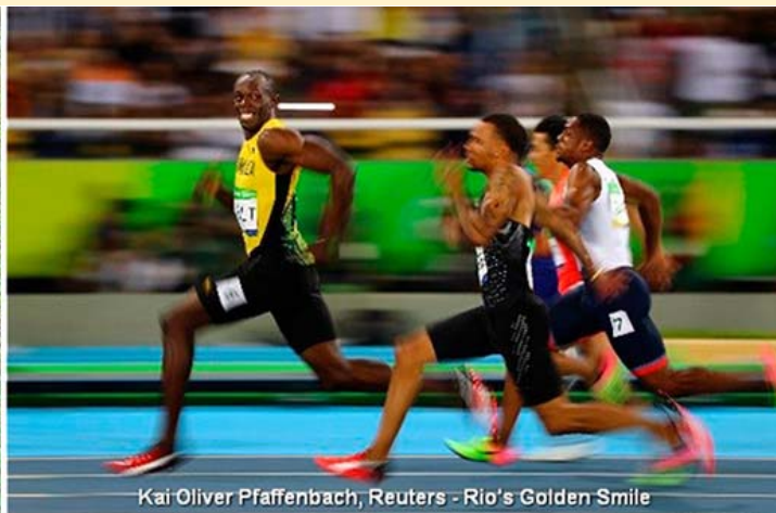
Rio's Golden Smile