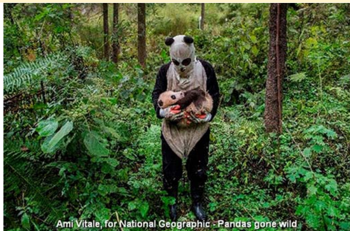
Ami Vitale, for National Geographic - Pandas gone wild