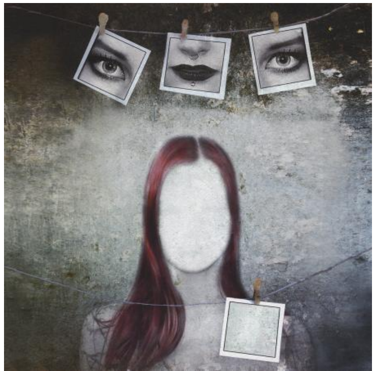
Captured Soul by Rikki O'Neil, Scotland