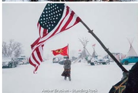
Amber Bracken - Standing Rock