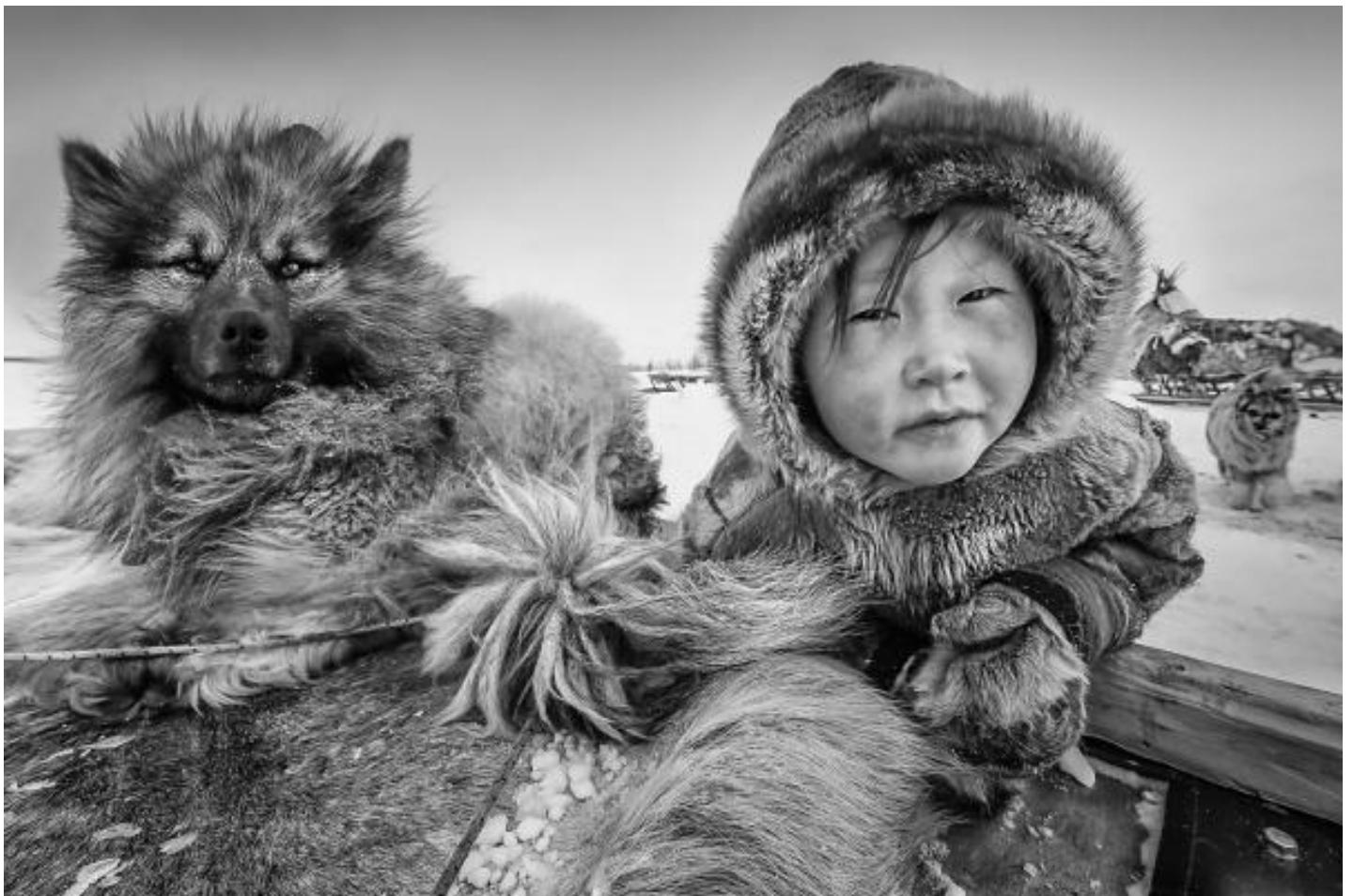
Little Nenets by Segrey Animov, Russia

http://www.scottish-photographic-salon.org/results