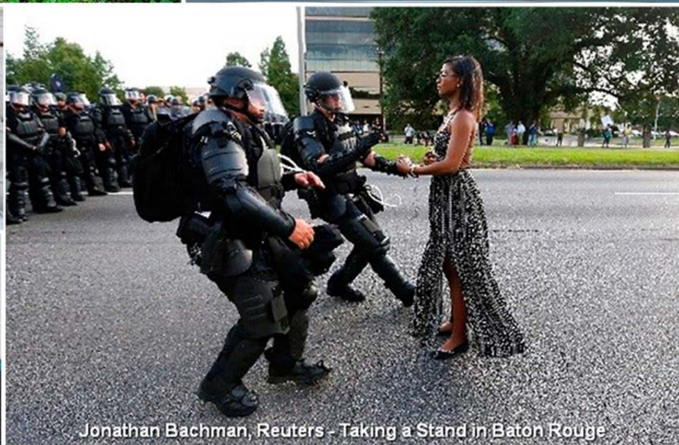
Taking a Stand in Baton Rouge